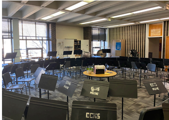
Existing Band, Chorus or Orchestra

Guiding Principle: We need a facility comparable to a modern high school music department, because our program is larger than a typical modern high school music department.