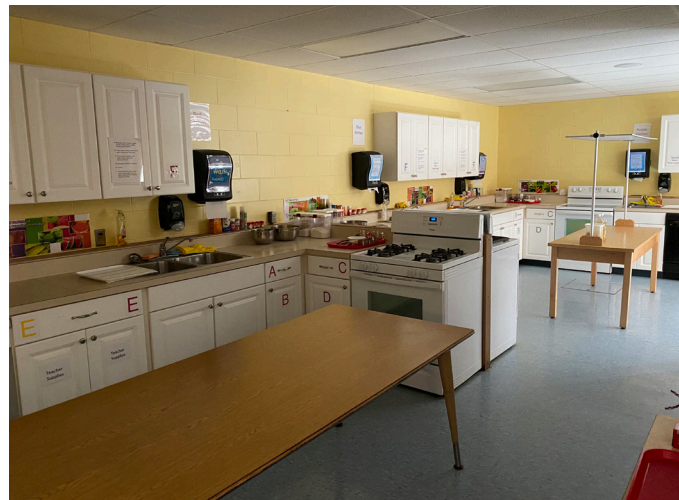
Existing Family and Consumer Sciences

FACS utilizes technology for solving human problems and meeting human needs. This discipline provides hands-on and inquiry-based experiences that deepen understanding of abstract concepts through encouraging the use of process skills, communications, and reflective thinking. It provides for the direct application of math, science, language arts and other academic skills. It also readily adapts to an interdisciplinary approach, helping students become aware of the connections between knowledge and skills in all areas of the middle school curriculum.