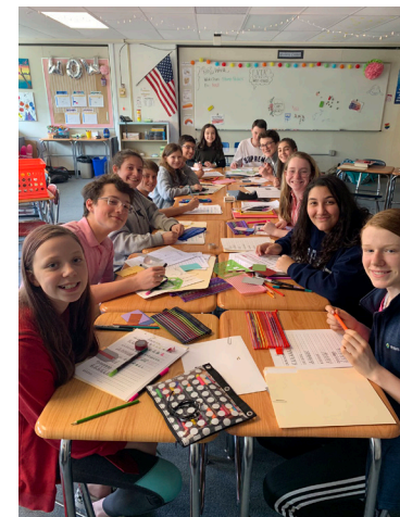
Group Work in Classroom

In addition, the English department partners frequently with the school library and social studies departments. Maintaining and fostering these connections for literacy across the curriculum and in conjunction with school resources is critical.