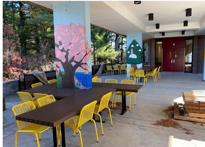
Existing Sanborn Learning Spaces

Using this model, students are exposed each year to a variety of concepts from the earth, space, life, and physical sciences, all taught within different thematic units. Much of the students' scientific knowledge is derived from or reinforced by experimental evidence and hands-on activities.