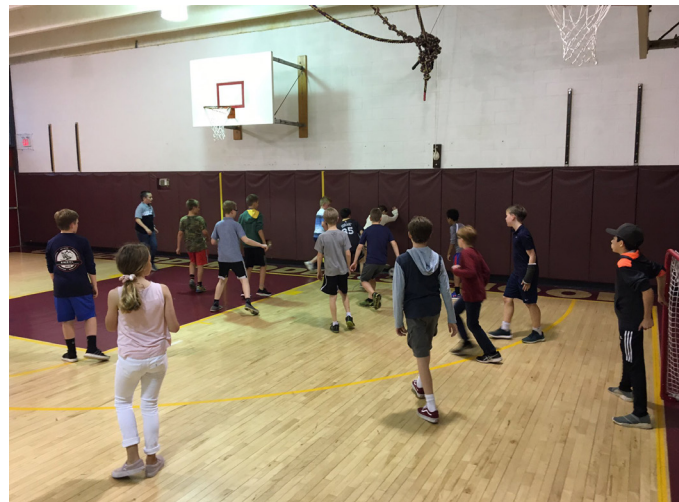
6th Grade PE