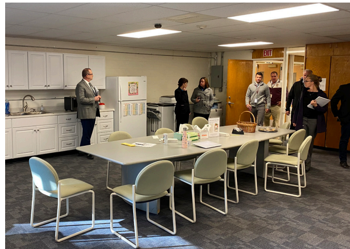
Existing Teacher Planning /Work, Break Room

Professional development will continue toward the inquiry and engagement goals for the future in addition to co-teaching, cultural competency, and student wellness. With a shift to online learning during the 2019-2020 school year as a result of the pandemic, it is expected that some use of the technology will continue in the future given increased participation rates. In a new school, the teams and departments would look to have adult learning space available to foster the professional environment possible. While a space devoted just to this is not required, a large group space that is flexible and offers opportunities for large group presentations and discussions as well as small group discussion would be optimal. Currently, the entire staff convenes at least monthly, most often in the school cafeteria at traditional lunch tables with poor acoustics. A space more conducive to professional dialogue and learning would be beneficial.