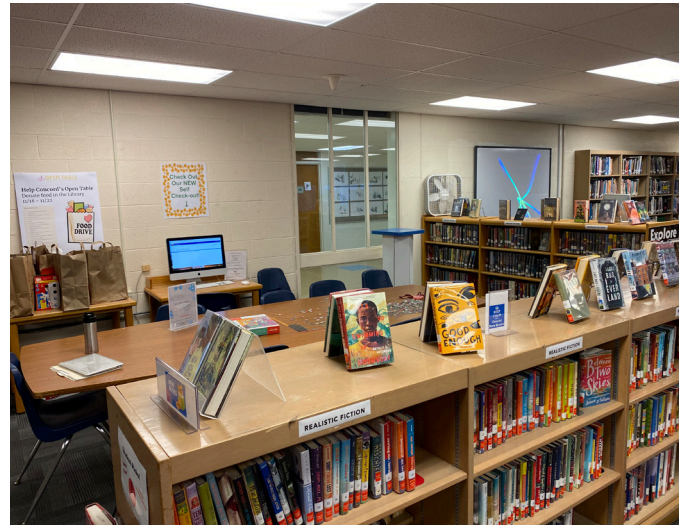
Existing Media Center/Library

Classes come in during the year for book talks supporting outside reading projects. Students in all grades receive individual and class instruction in search strategies for electronic reference applications, periodical indexes and the Internet.