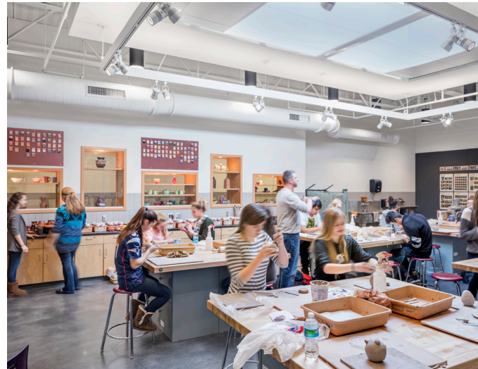
Example of New Visual Art Classroom

Students practice drawing skills that are fundamental to all art making. This includes representational and non-representational approaches.