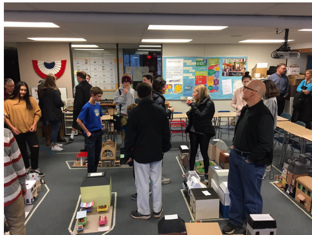
World Languages City Project

The World Language teachers at CMS have been trained in OWL (Organic World Language) and CI (Comprehensible Input). Both methods of teaching focus on developing students’ proficiency through targeted means of study.