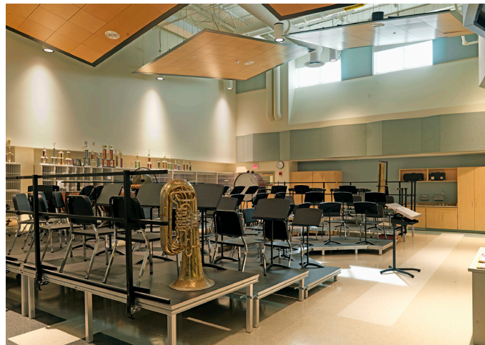
Example of New Band, Chorus or Orchestra