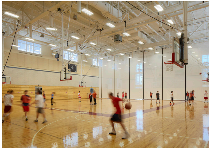
Example of New Gymnasium