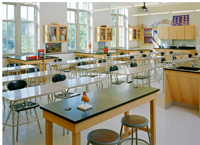
Example of New Science Classroom