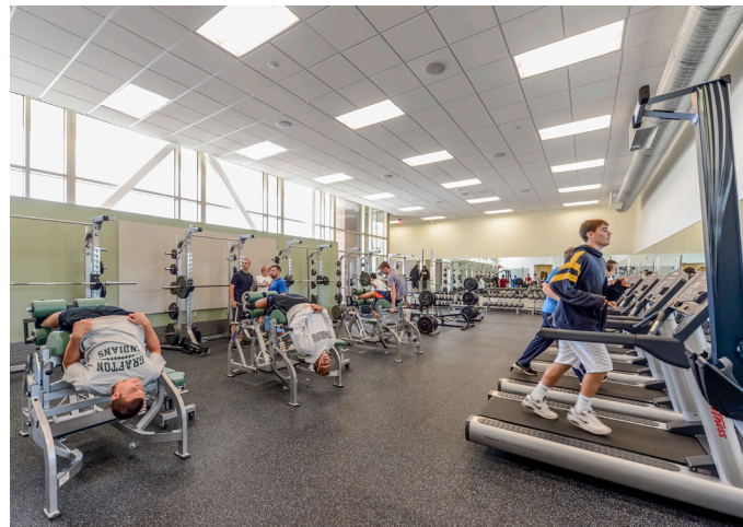
Example of New Alternative PE Space

The core physical education program currently conducts multiple classes simultaneously. The proposed schedule in a new middle school would require three classes to occur at once. The vision of two classes in a shared gymnasium space would meet the curriculum and activity needs. An additional third space of mixed use creates opportunities for equipment and activities that we are currently not able to provide such as aerobic fitness equipment. As mentioned, the space is also highly utilized in the extracurricular athletic program, especially during the winter basketball season where students often stay to watch basketball games afterschool.