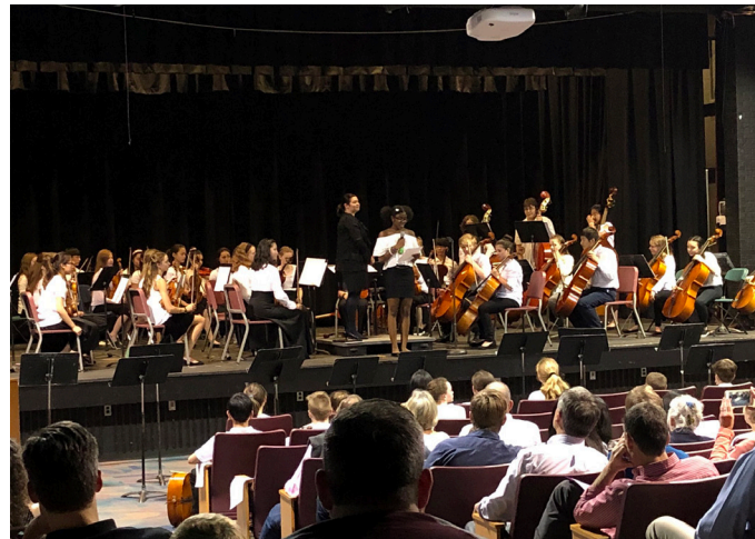
Orchestra Concert at Sanborn