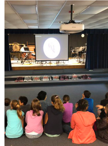
6th Grade Forum Assembly