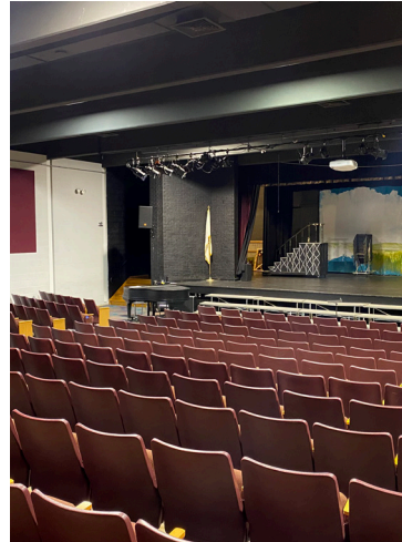
Existing Sanborn Auditorium

school cultures, special presenters, and anti-bullying. A small auditorium that houses one grade level will allow for these events but requires repeated performances and additional cost often. A larger auditorium would minimize the repetition and create a stronger school culture when more students can be combined. It is understood that any whole school event would need to occur in the larger space of a gymnasium.