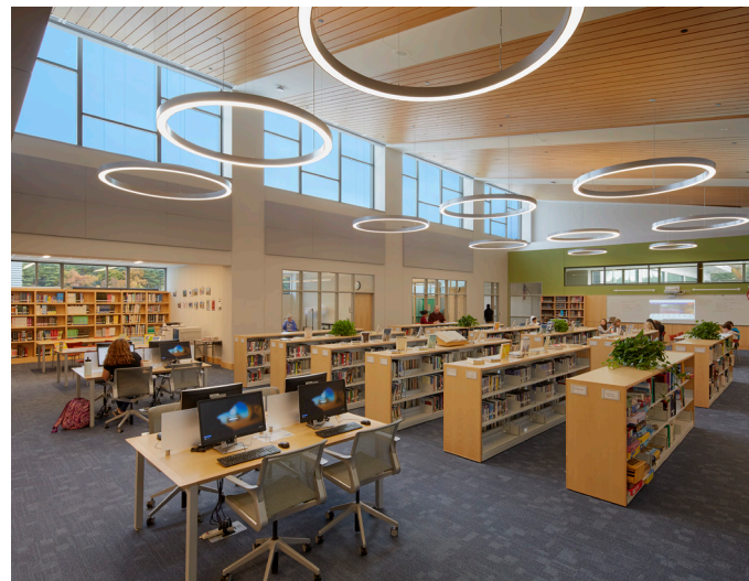
Example of New Media Center/Library