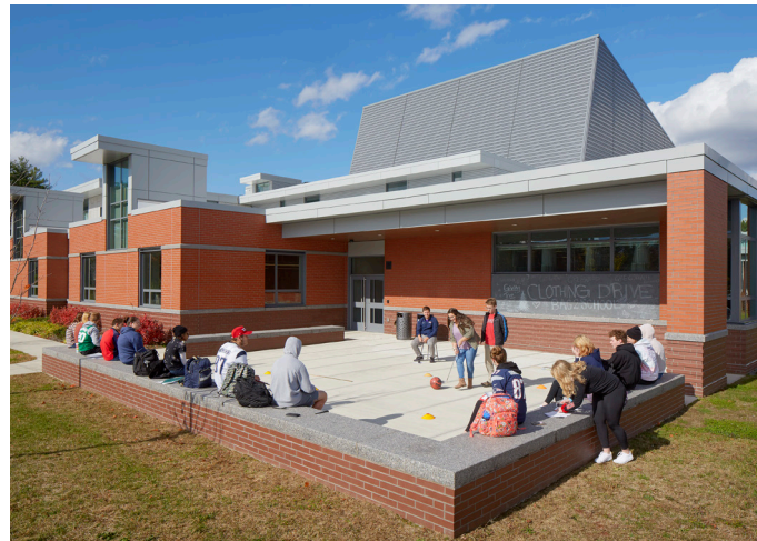
Example of New Learning Spaces