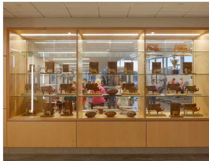
Example of New Visual Art Corridor Display