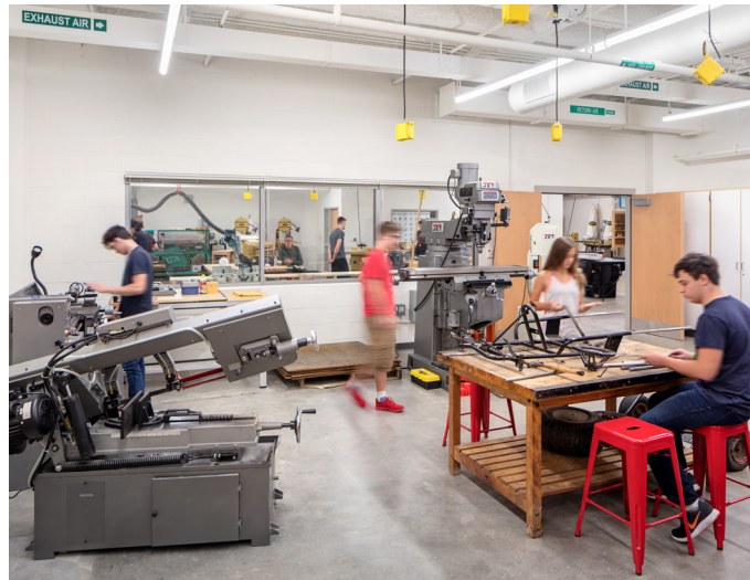
Example of New Applied Technology Space

Thoughtful design of this space would include a large storage closet for supplies, ample open shelf storage for student projects, multiple outlets at all workstations (perhaps coming from the ceiling as they do in the engineering space at CCHS), robust tables, hot and cold running water, adequate ventilation, and other safety features (eyewash stations, goggle cabinets). This space would also require a traditional teacher projection area.