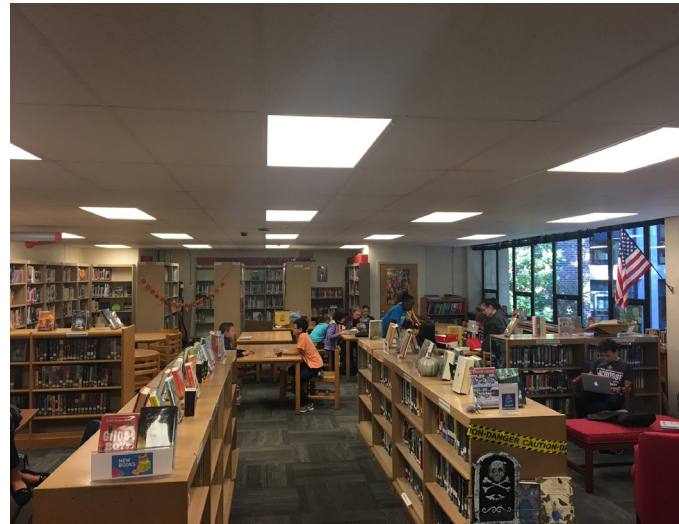
Existing Sanborn Library

Volunteers have also assisted in processing and displaying new books for the Annual Read-Off, a non-competitive reading program that runs for four weeks in the spring, beginning with National Library Week.