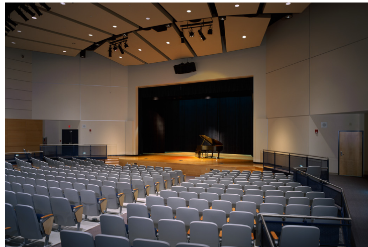
Example of New Auditorium