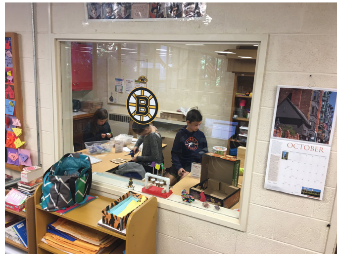
Existing Sanborn MakerSpace

Description: Facilitated by the CMS library staff; our Makerspaces are the newest additions to our middle school STEM offerings and provide an opportunity for student “tinkering” that can be hard to fit into the confines of more formal class structure. Access to the makerspace can happen during afterschool club time, elective blocks, and on a drop-in sign-up basis. For an idea of some of the fun projects taking place in these spaces, check out the Makerspace webpage . Discussion has ensued about combining the engineering and Makerspaces in the future. This is a drop in activity currently with hopes for full class access in the future.